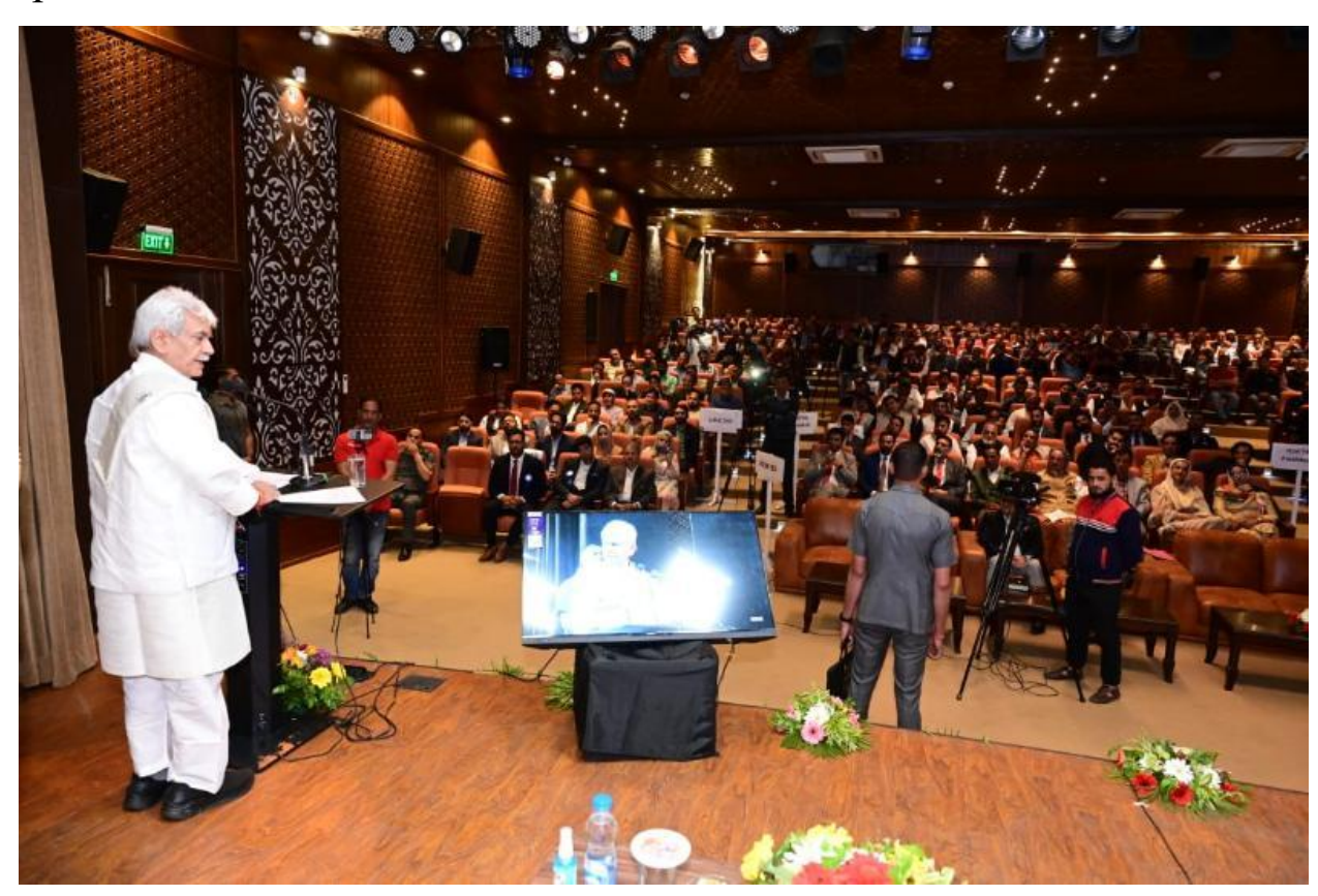
The Lt Governor also highlighted the steps taken to fulfill the aspirations of all 40 ULBs of Kashmir Division.

"The holistic approach in developing urban infrastructure is focused on Individual's well-being, new avenues and opportunities for the people for more diversified incomes, improved service delivery, mobility, cleanliness and to achieve the objectives of sustainable urban development," the Lt Governor said.